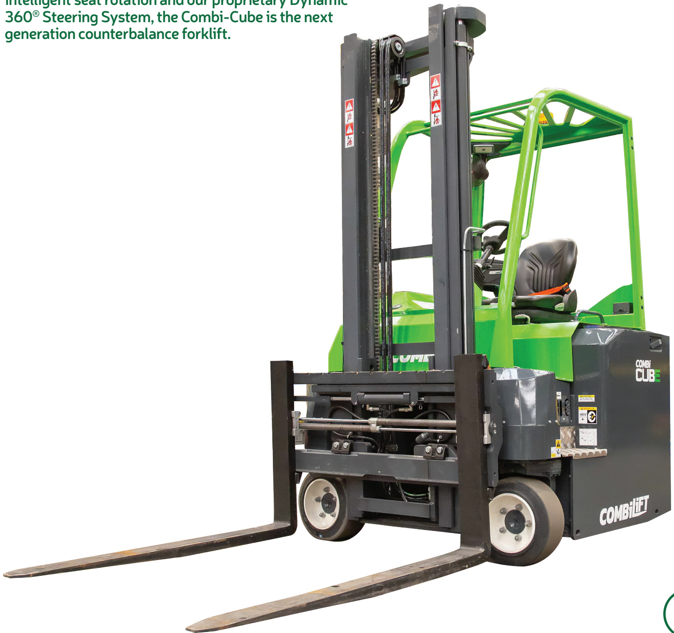
Optional: Fully Enclosed Cab